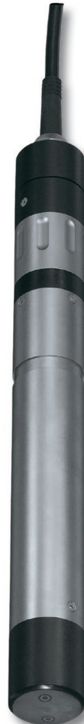
TetraCon® 700 IQ

Compared to the 2-electrode sensors, the TetraCon® 4-electrode measuring procedure offers considerable application targeted advantages, especially in the area of higher conductivities.