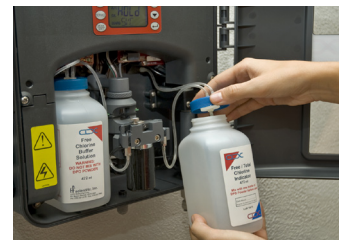
Changing the Reagents

The Residual Chlorine Monitor shall be able to measure free or total chlorine using the DPD colorimetric method. The Chlorine Monitor shall have a measurement range of 0-10 mg/l. The Chlorine Monitor shall include the power supply, sensor and display in one NEMA 4X (IP66) corrosion resistant enclosure. The Chlorine Monitor shall have readings consistent with laboratory and portable Chlorine Photometers. The Chlorine Monitor shall have standard 4-20 mA outputs and RS-485 with Modbus Protocol. The 4-20 mA output shall be standard or reversible. The Chlorine Analyzer shall have a removable sample cuvette. The sensor shall have a clear view to the optical chamber allowing viewing of the sample and reaction of the reagents, before, during and after a reading. Accuracy shall be \pm 5\% with a resolution of 0.01 mg/l for the range of 0-6 mg/l and \pm 10\% with a resolution of 0.01 mg/l for the range of 6-10 mg/l. The Chlorine Monitor shall have a user selectable cycle time between 110 seconds and 10 minutes (optional 60 seconds to 10 minutes). The Chlorine Monitor shall be capable of 30 days of unattended operation. The Chlorine Monitor shall take a zero reading before each reading to compensate for color in the sample. The Chlorine Monitor shall have microprocessor based technology. The Monitor shall have two user selectable alarm relays.