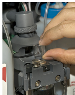
Changing the Sample Cuvette