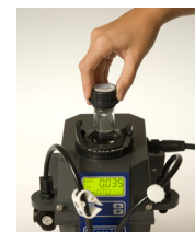
*figure 2 Easy Calibration